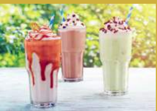
Chef's Recommendation 🥷